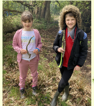
Year 4 and 5 Bushcraft teaching team